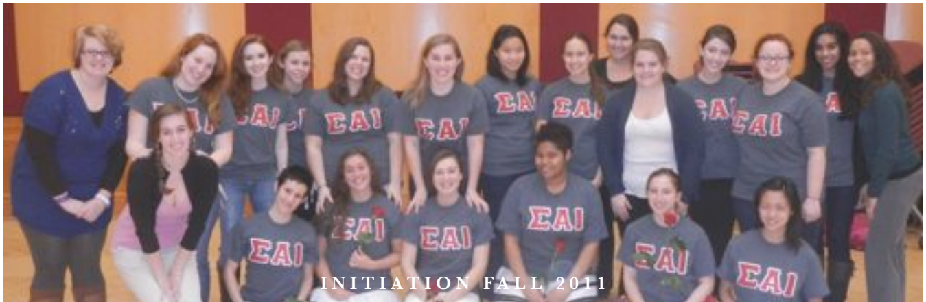
INITIATION FALL 2011