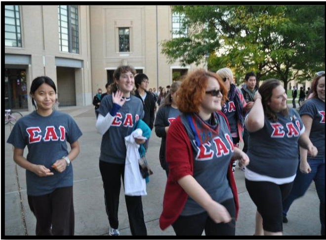
Alpha Mu at Relay for Life 2010

Not only did we raise money for a good cause, but the event was a very special experience. We took time to think and reflect, and to laugh and celebrate. We are looking forward to participating in Relay for Life next fall.