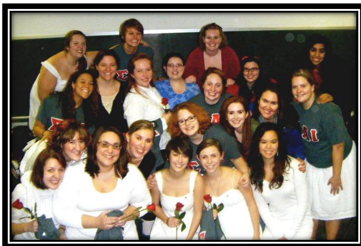
Alpha Mu, Fall 2010 Initiation